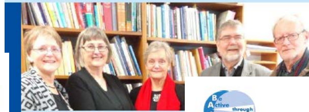
The Mapping team of U3A Reykjavik